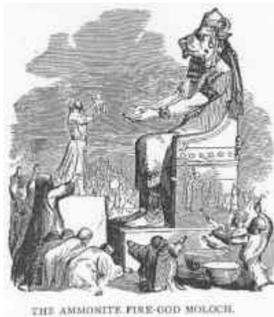
THE AMMONITE FIRE-GOD MOLOCH.

And thou shalt not let any of thy seed pass through the fire to Molech, neither shalt thou profane the name of thy God: I am the LORD. Leviticus 18:21