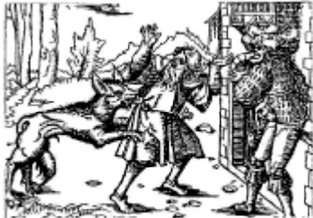
Werewolf attacking a man from a 15th century German work called The Wild Beast of Gevaudan